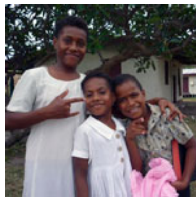
Meet the locals