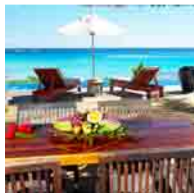
Read that book