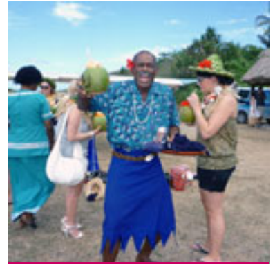
Meet the locals