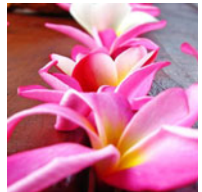
Enjoy the beauty